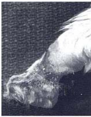
Necrosis and sloughing of soft tissue following onychectomy