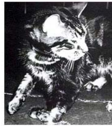
Radial neurapraxia associated with onychectomy