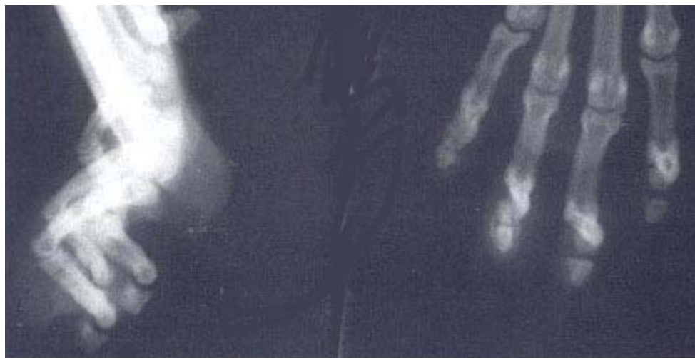
Radiographs depicting inadequate amputation of the third phalanx in a cat with regrowth of claws following onychectomy. When there is evidence of regrowth at one site, it is common to find an excessive amount of the third phalanx remaining at additional sites.