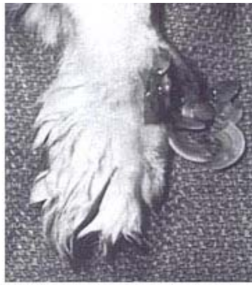
Regrowth of claws associated with inadequate amputation of the third phalanx of the first digit